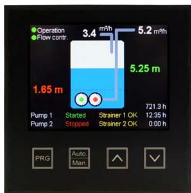
programmable logic control KFM 803